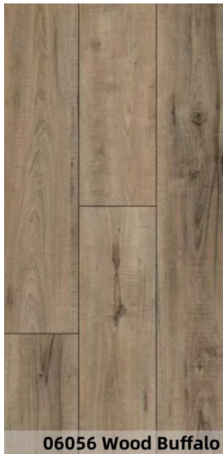
06056 Wood Buffalo