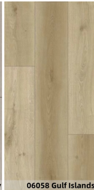
06058 Gulf Islands