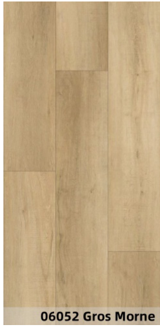
06052 Gros Morne